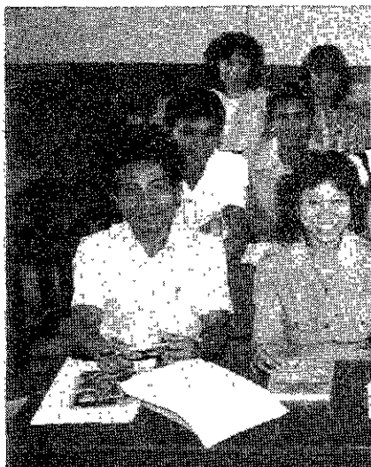
Students busily prepare for and happily